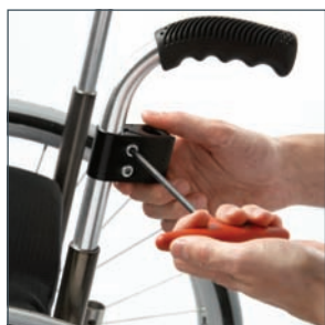
Installing the mounting blocks