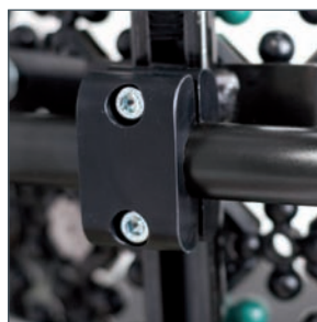
V-Trak Lite with a Matrix System