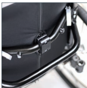
V-Trak Lite with Comfort