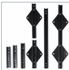
Wide range of tracks for Specialist seating